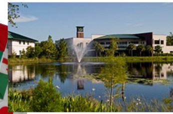
FORT MYERS, FLORIDA