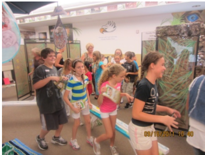
Doing the "Pink Panther Dance"