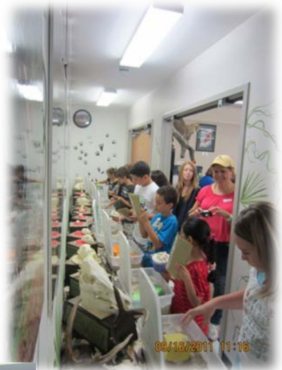
Right: Students are making tracks at the new Panther Posse classroom in Reed Hall on the FGCU campus.