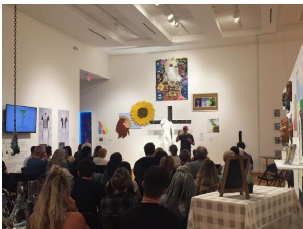
Final Storytelling Slam in the Wasmer Art Gallery

This year, the Wasmer Art Gallery, in partnership with the FGCU Creative Writing Community, has hosted a series of storytelling slams. The final slam was on April 24 and featured a backdrop of the artwork of Senior Projects, Spring 2019 . Each evening had a theme, and the 5-7 minute stories were then judged and prizes were awarded.